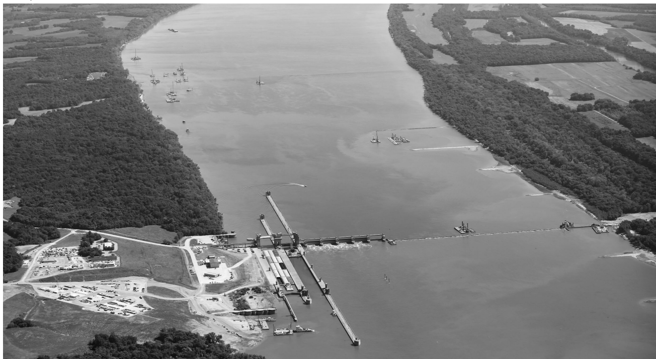
Olmsted Locks and Dam August 2019