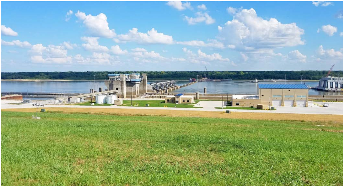
Olmsted Locks and Dam, Ohio River