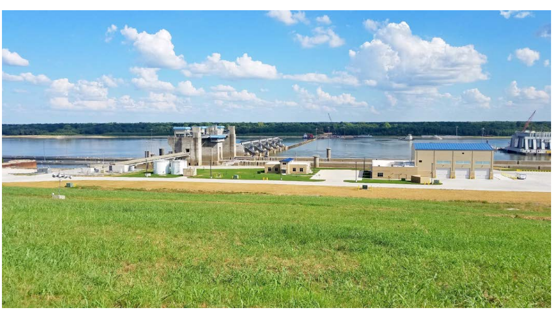
Olmsted Locks and Dam, Ohio River