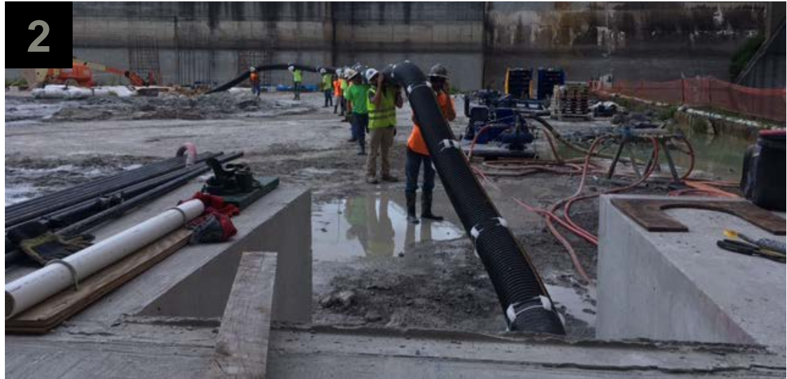
1. 29 Aug 2017 - Overview of Lock Excavation site; 2. Installing rock anchor plastic sheathing; 3. Completed rock anchor support block with rock anchor installed.