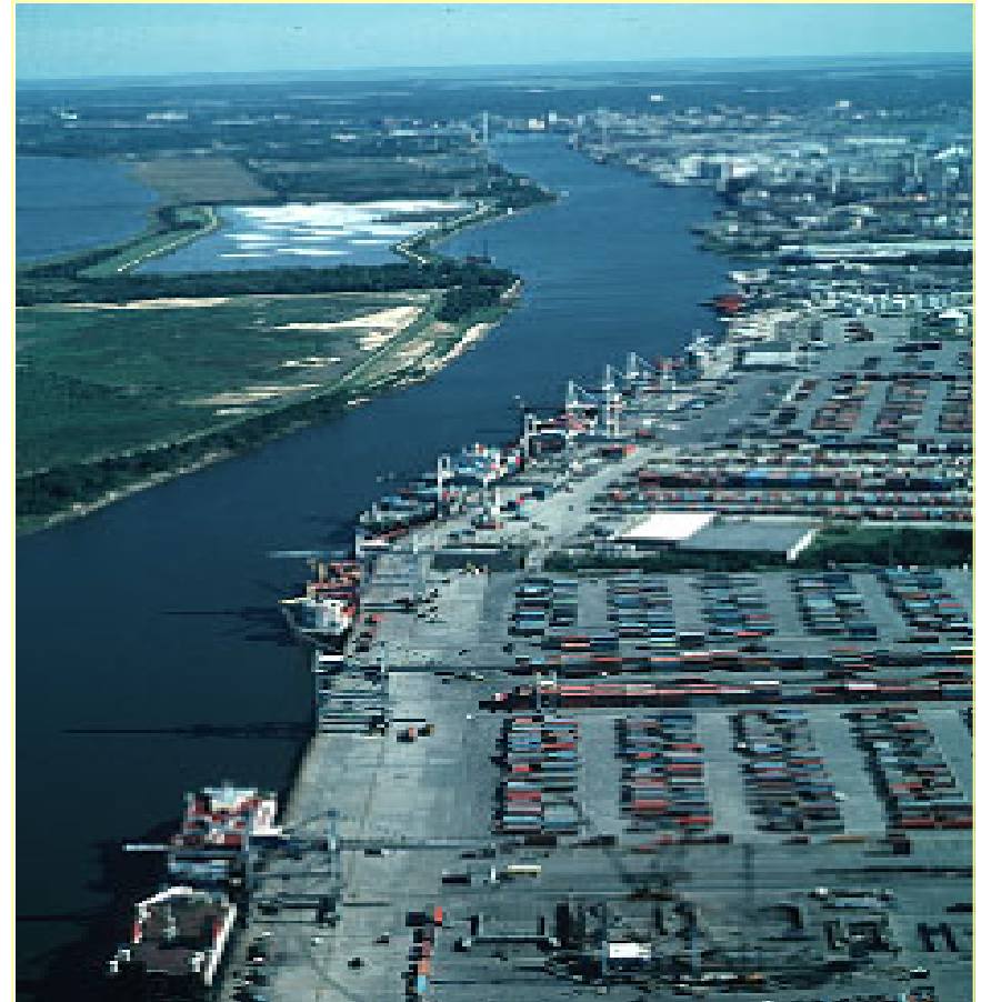
Savannah Harbor Port Facilities, Georgia