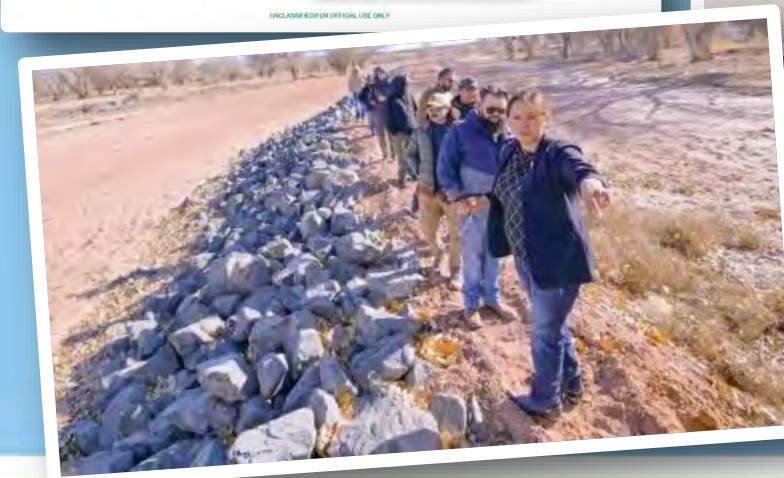
Top Left: Excerpts from Birdsprings Chapter EAP workshop. In person and virtual attendees participated in a mapping exercise and EAP development. Top Right: In-person attendees at the Navajo Nation Flood Risk Awareness Workshops in Chinle, AZ. Bottom Left: Chinle Chapter Officials & Staff led site visit to describe the impacts of the April 2023 flood.