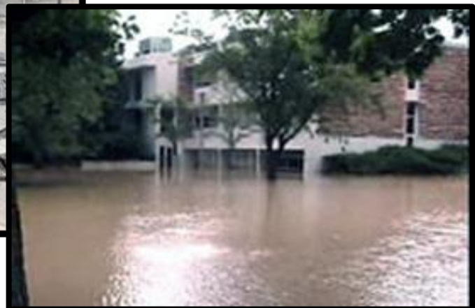
Fort Collins, 1997