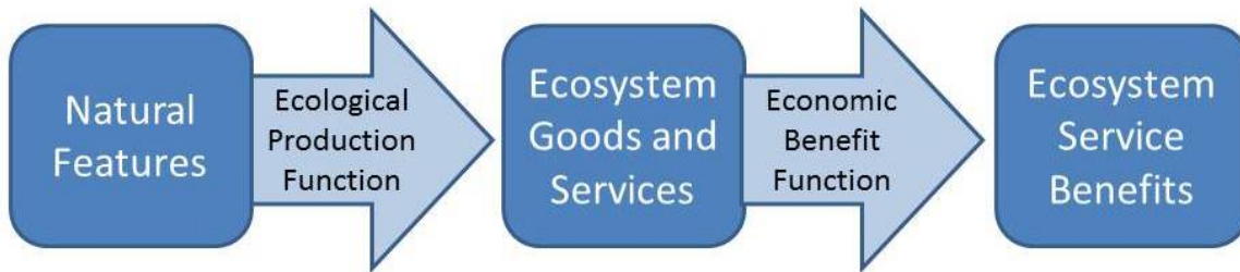
Figure 1. Simplified framework for consideration of EGS supplied by natural features and the benefits they provide.

information to aid in portfolio applications and conveying the value to the nation from investments through the Civil Works program.